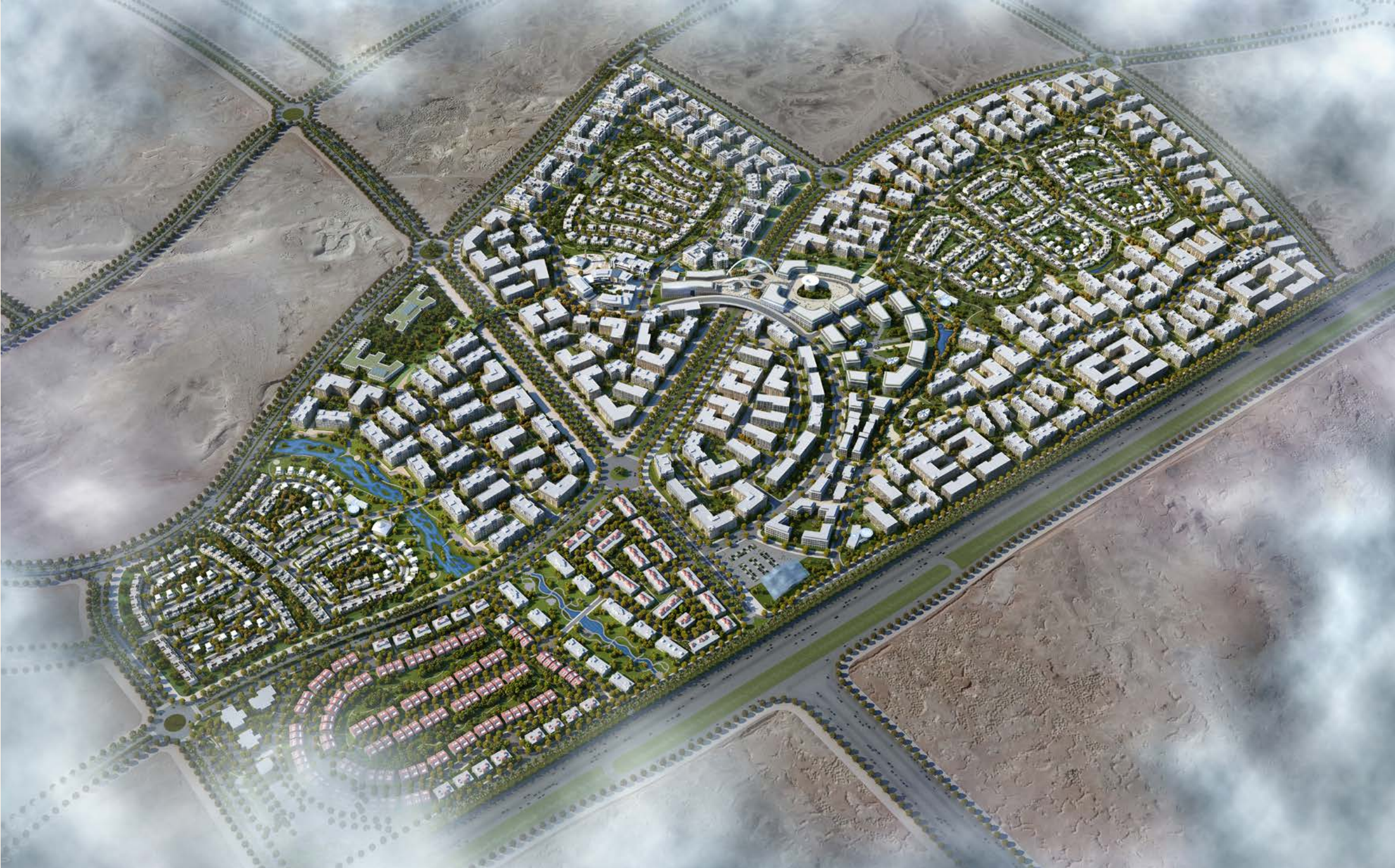
*FIGURE ONE: FULL MASTER PLAN