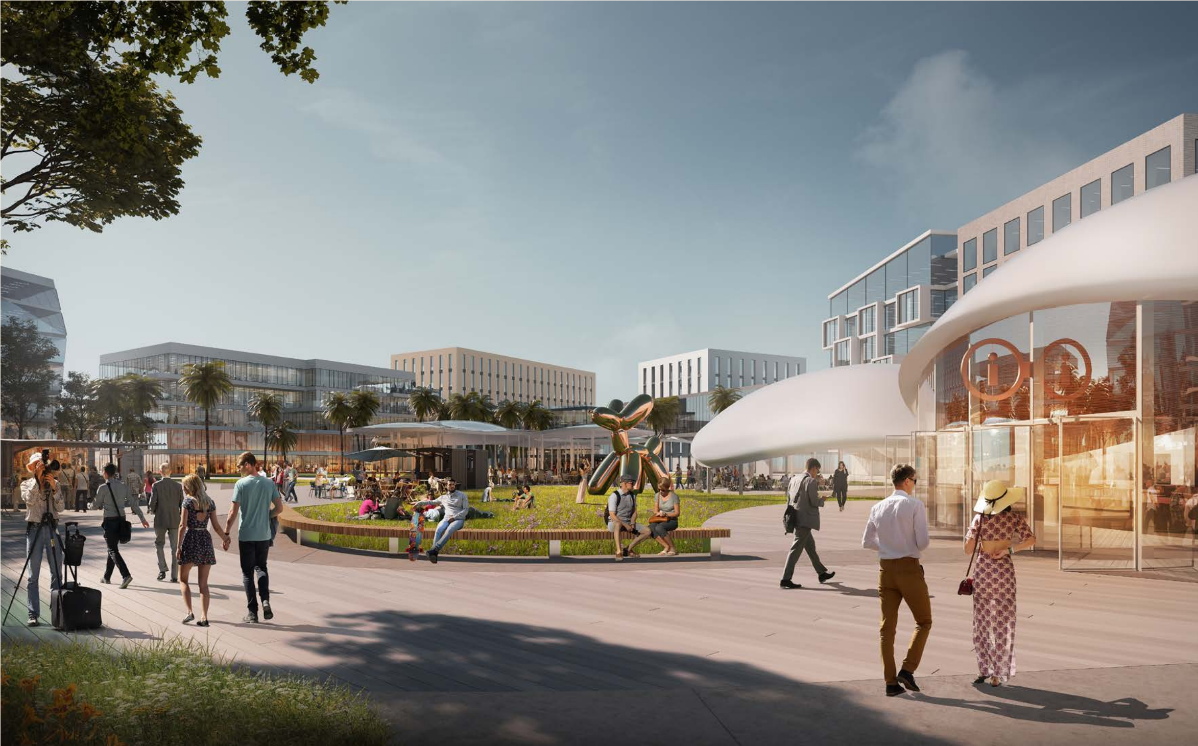
*FIGURE THREE: PLAZA