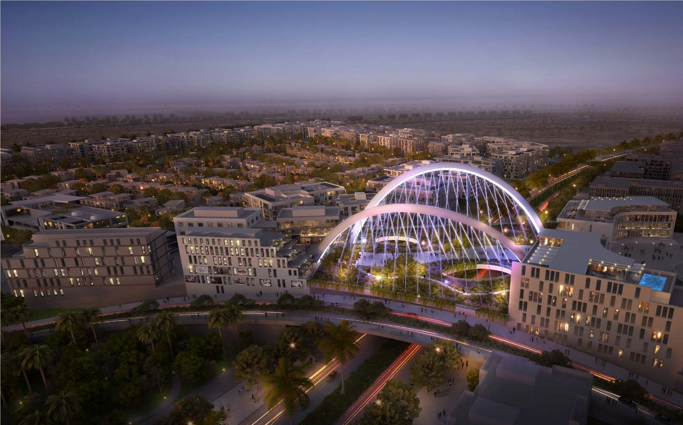
*FIGURE TWO: BRIDGE